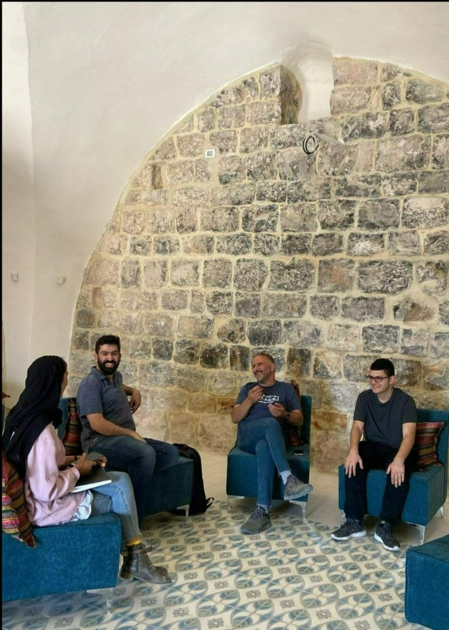
Dedicated Seraj Palestine staff meet to discuss details of the trip.