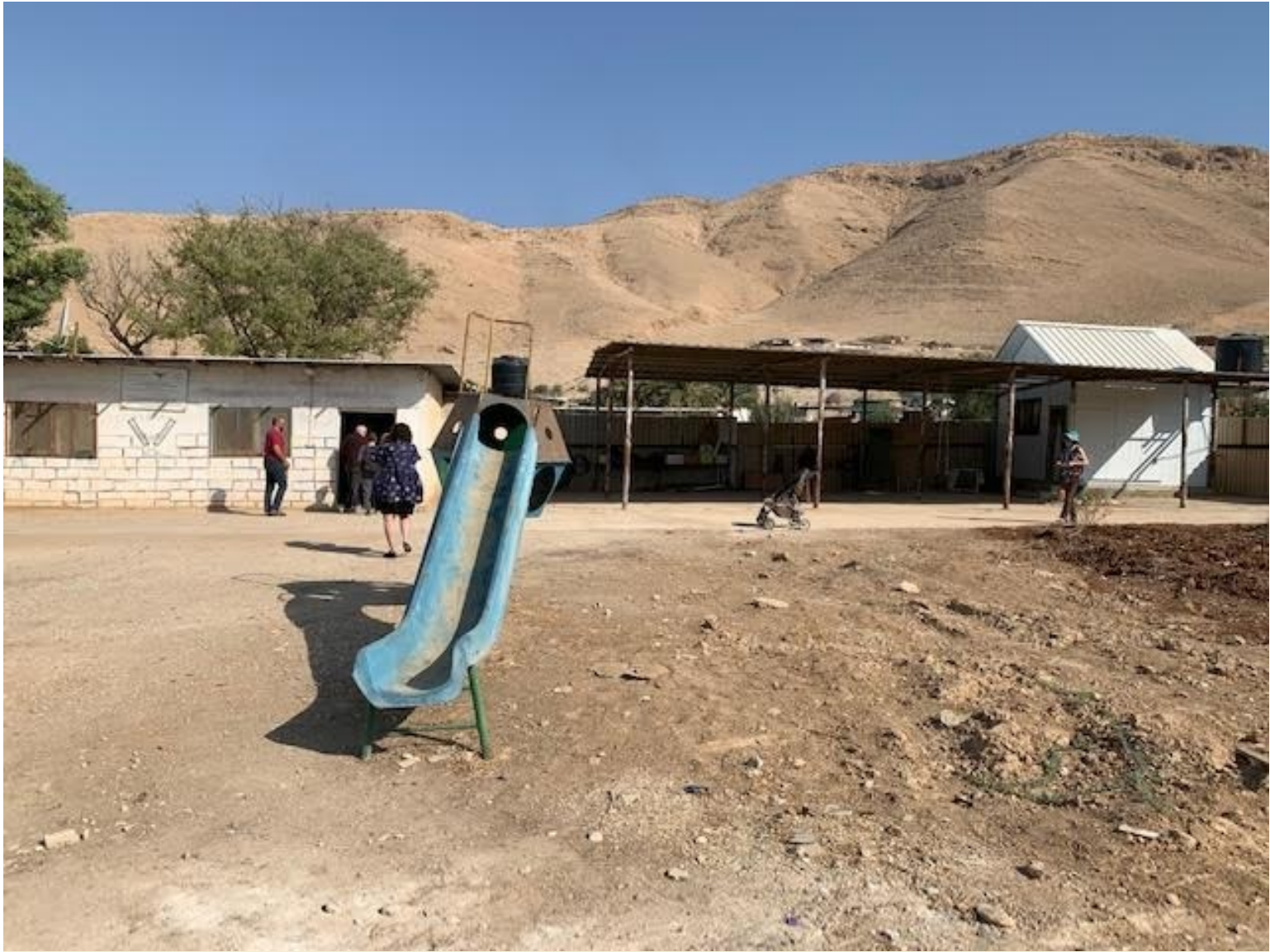
The exterior of the Seraj library and women's center in Jiftlek