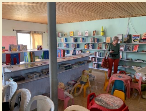
The children's library in the Seraj building in Jiftlek