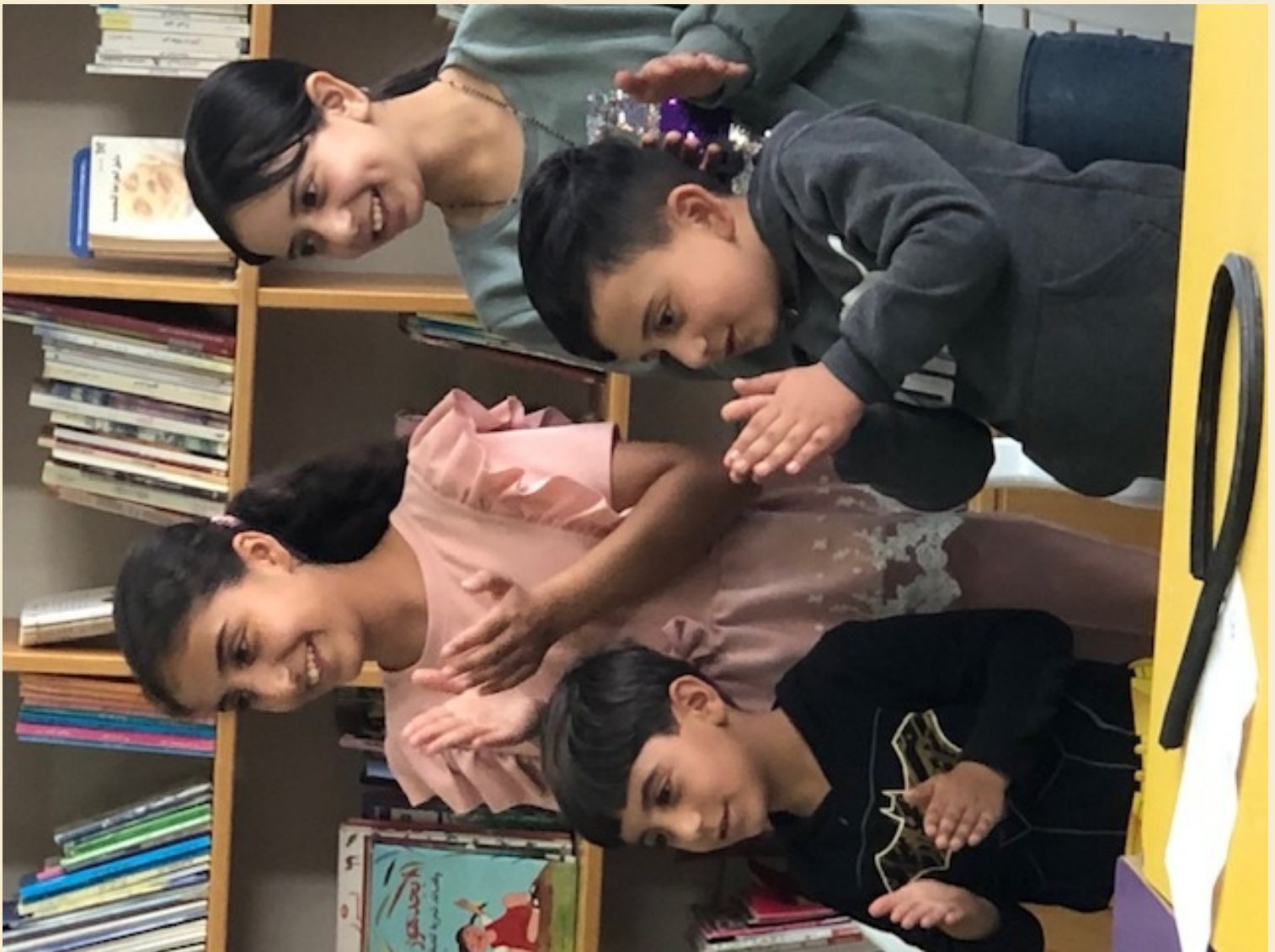
Patrons enjoying warmup exercises at Al-Mizzra Al-Sharqiyyeh library.

We'll continue sending updates on our journey. Watch your email.