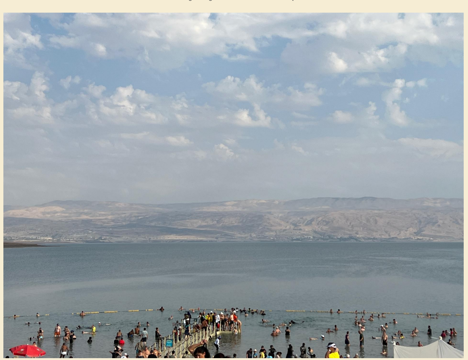
Enjoying the reputed health benefits of the very salty Dead~Sea