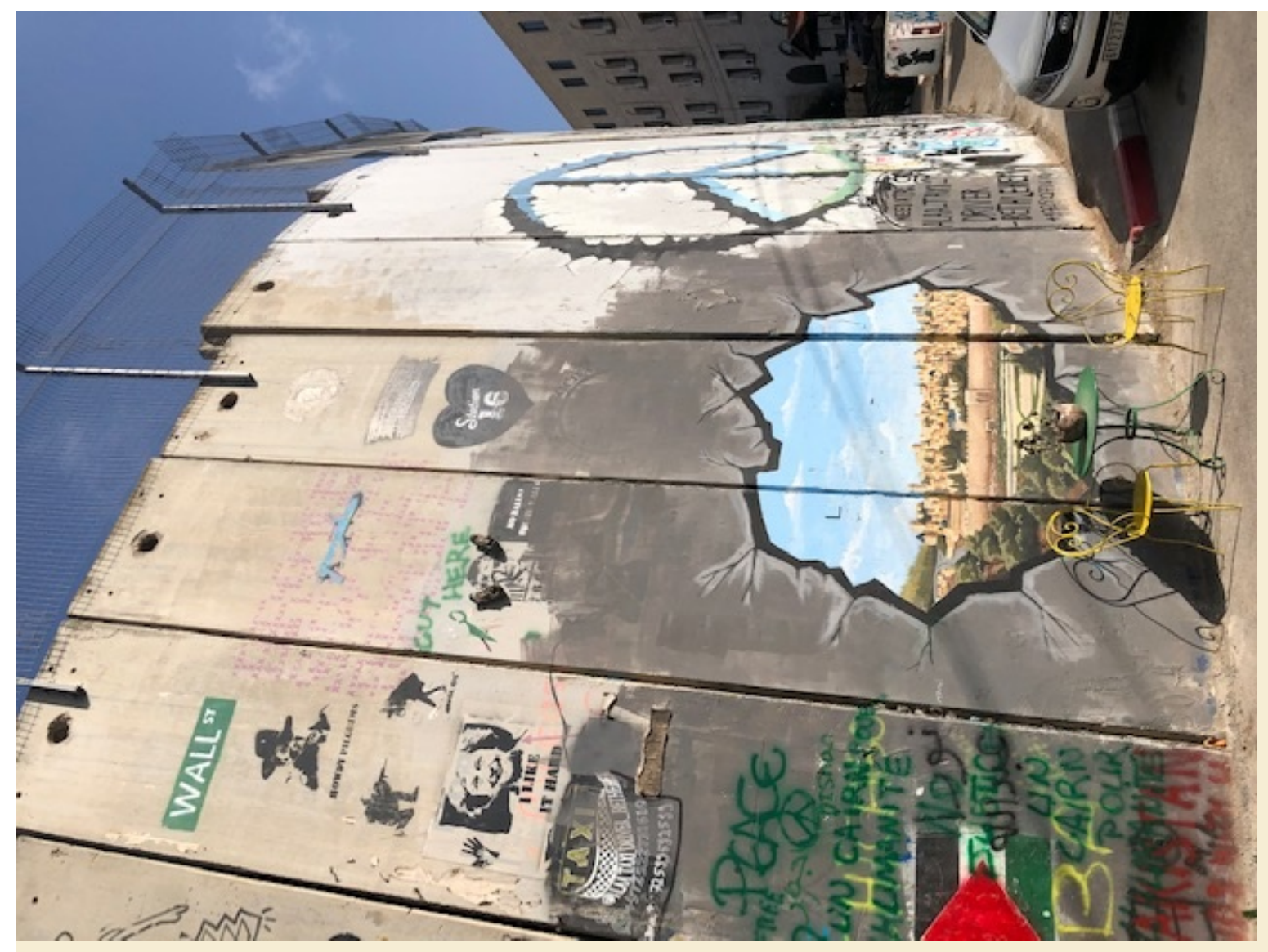
A trompe d'oeil has to suffice since the view from a village to Jerusalem has been blocked by The Wall.