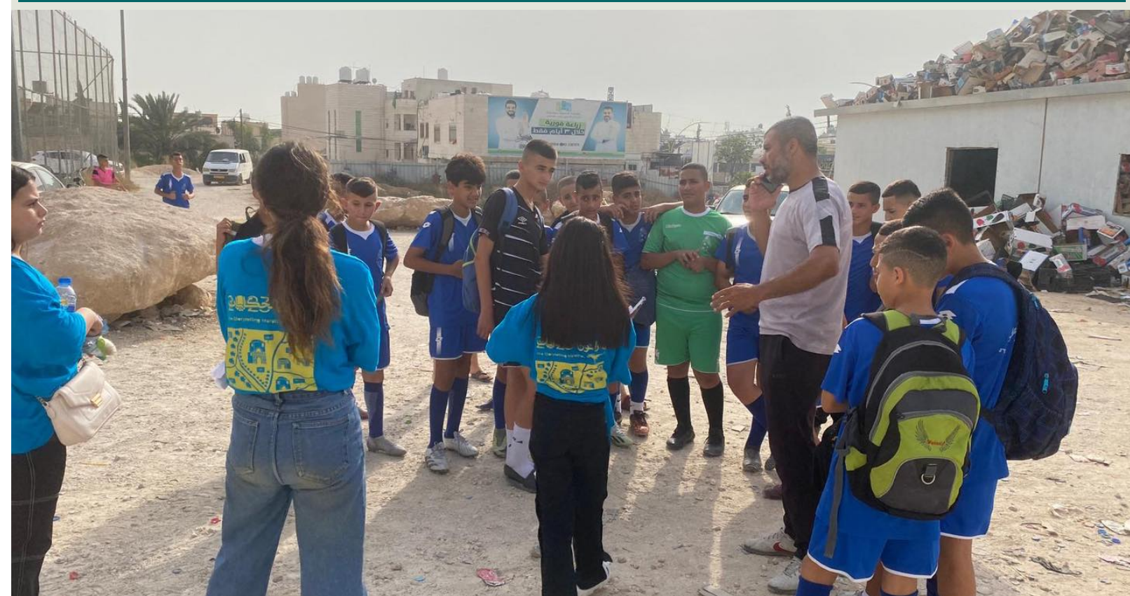
Let the Storytelling Marathon roll.