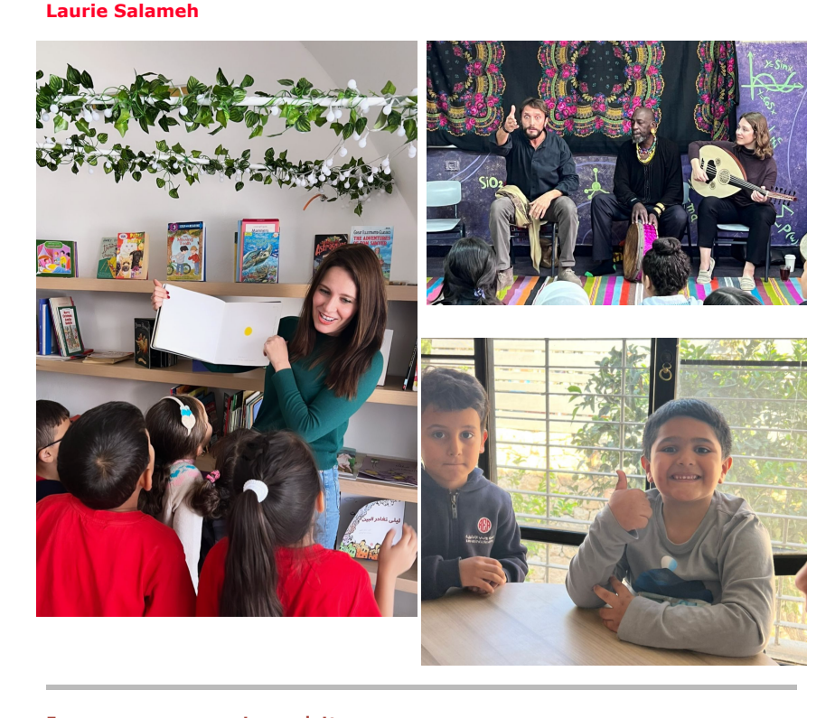
In case you missed it, the 10 minute 2022 Seraj Tour video.