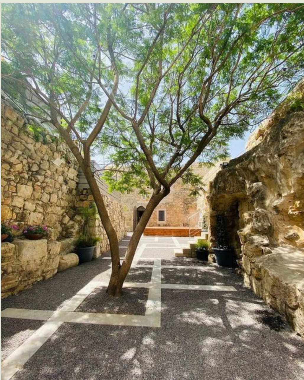
The abandoned courtyard of a historic home and its preservation as a Seraj Cultural Center.

The Seraj Library and Storytelling Center is in Kufor Aqab, which was once a sleepy village and is now a crowded city of over 100,000, because it is the only place where families can live if some members have Jerusalem IDs and others have West Bank IDs. The center has become a destination for field trips from schools, clubs, and other Seraj libraries. The storytelling room and garden are always busy.